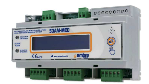
Alarm unit for on/off contacts