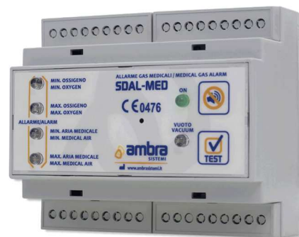
Alarm signaling unit for gas distribution pipeline