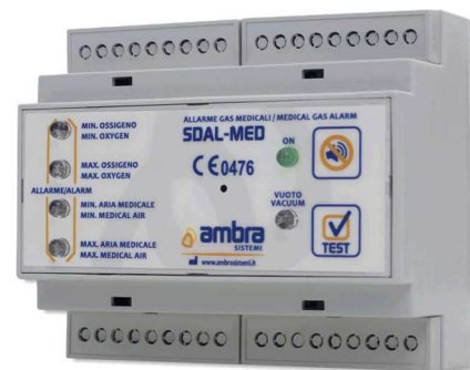
Alarm signaling unit for gas distribution pipeline

-Monitoring of 2 nd stage pressure regulators for medical gases